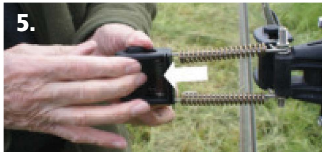
5. Pull the pin roller to slide and pinch the tapes.