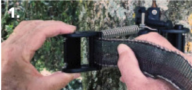
1. Insert the tape through the slot on the plastic buckle.