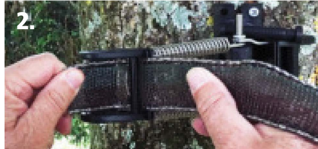
2. Now pass the tape back through the bigger slot.