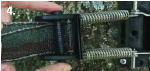
4. Insert the pin roller at the front of the 2 layers of tape.