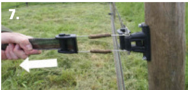
7. ... to block the pin roller.