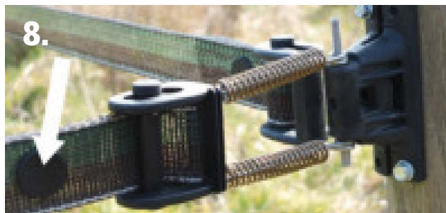
8. Apply one round clip so the tape doesn't slip.