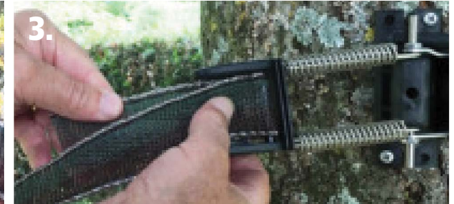
3. Press the two sections of tape together at the bottom of the buckle with the end of the tape is at the back.