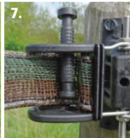
7. Insert the pin roller in front of the 2 layers of tape.