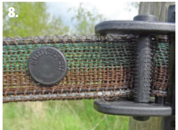
8. Use a round clip so that the tape doesn't slip. A screwdriver can make a little hole for the clip.