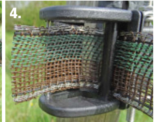
4. To tension the tape, thread the tape this way.