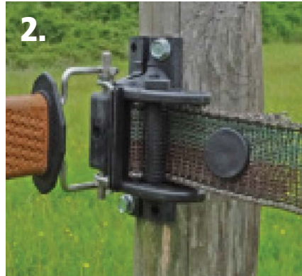
2. If installed at a gate, unscrew the two axles to remove one wing, creating room to attach the handle.