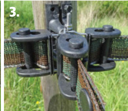
3. To make a T junction, a third wing can easily be installed to the axles.