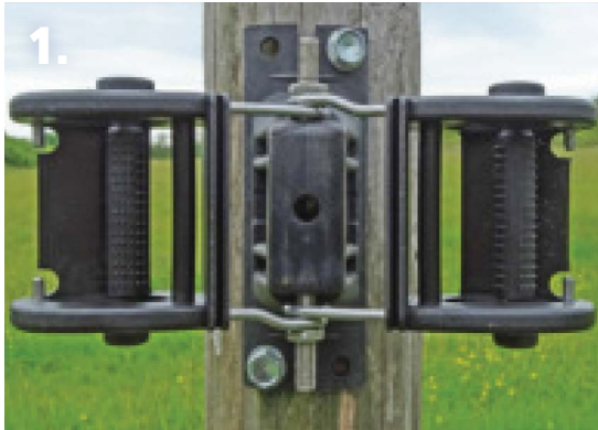
1. Screw the #BP37 with 2 lag bolts on to a wooden post or a hose clamp on a metal post.