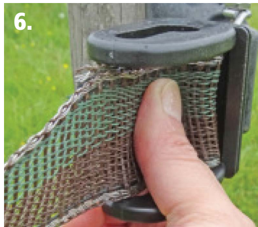
6. Press the 2 sections of tape together at the bottom of the buckle.