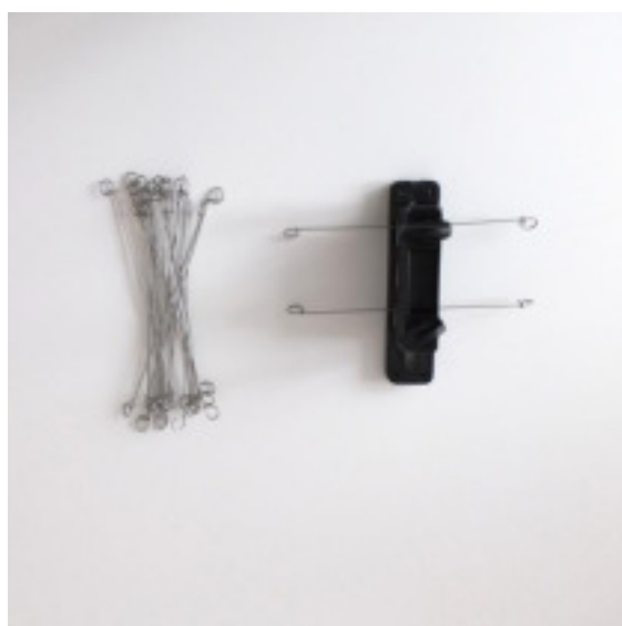
#8bl + #56T for metal posts