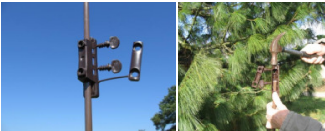
#8bl + #7A