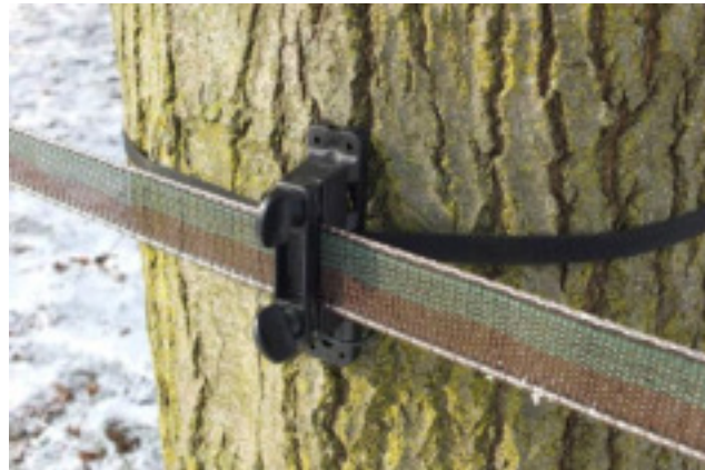
#8bl + #BT150

A tree acting as a post must be sufficiently large to stay stable in the wind to prevent the tape rubbing and causing undue wear.