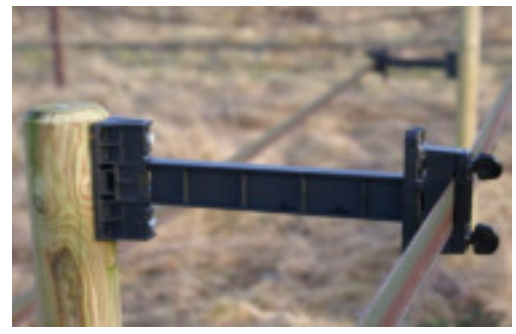
#13EX + #8bl