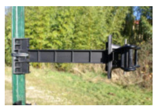
#13EX + #BP37