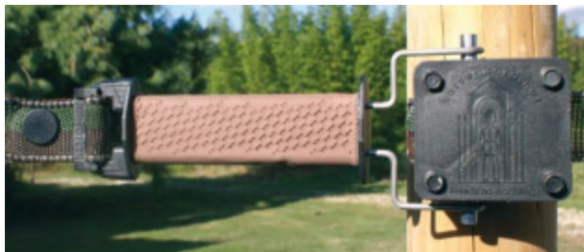
#BP12A + #9bl

landrine@horseguardfencing.ca 1.800.817.6930 (TOLL FREE) horseguardfencing.ca