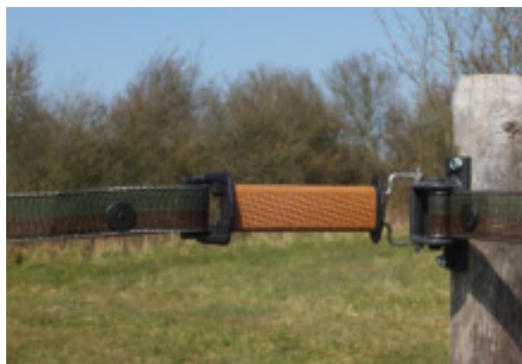
#BP13A / #BP37 without cables